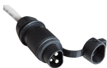
10229 - Plug DIN 9680, 3-pin, 6-24 V, max. 25A, IP54